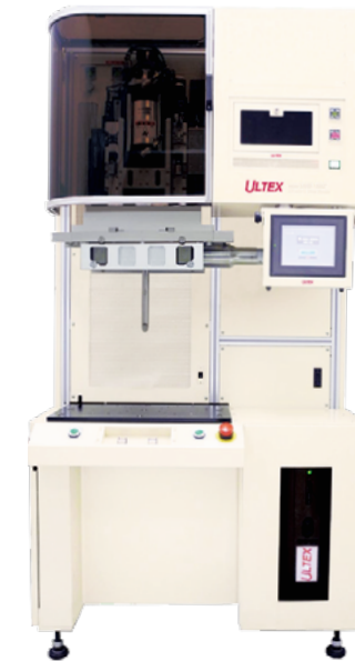
SoundBonding system 15MZi series