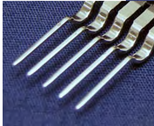
[Dipped the terminals in vibrating solder bath without flux]