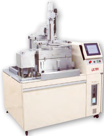
Cavity Soldering System/CSS