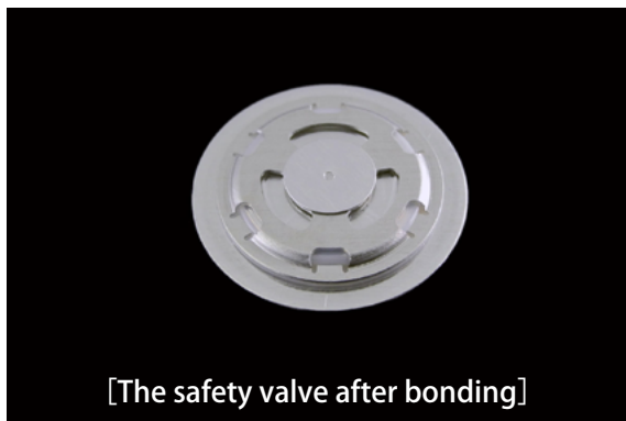
[The safety valve after bonding]