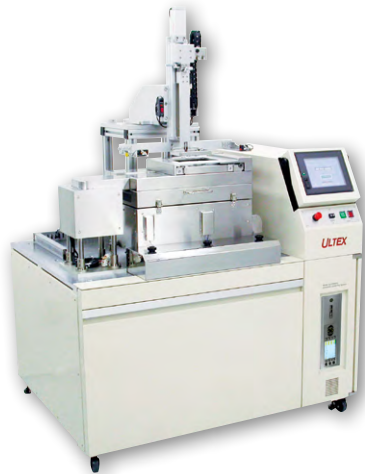
Cavity Soldering System/CSS