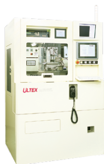
model FCB-SH50MP Semi-automatic Flip-Chip Bonder

Substrate ; Au plated pads on 2 layers of film