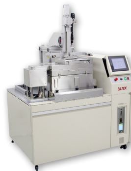
Sound Cavity Soldering System/CSS